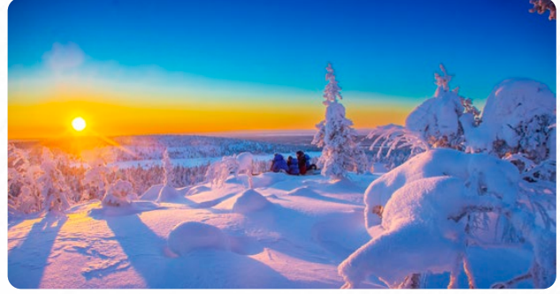
DAY 6 > Optional day > Evening snowmobile in sled